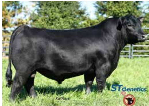
Myers Fair N Square M39

A Regiment son offering double digit CED and tremendous growth, he covers all the bases throughout his EPDs. His dam stems from the Basin Lucy 3829 cow, a great proven cow family. 6062 has been a donor in our program; she brings along excellent feet and udder quality and also adds phenotype. He will make a great herd bull that has strong maternal and end-product merit.