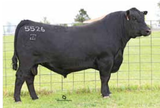
GAR Quantum Sire of Lots 135 and 137.