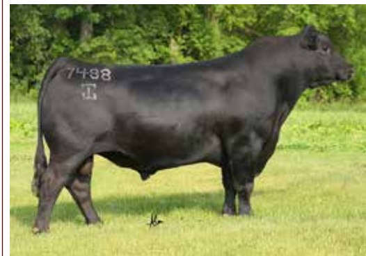
GAR Home Town

A high performance calving ease Iconic son. Check out the growth curve, elite carcass traits and $ values in this stud. This guy checks a lot of boxes. His 7 year old dam never misses, always producing a great calf. He has all the pieces to make a great herd bull.