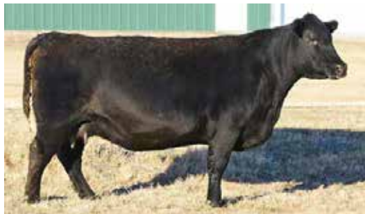
GVC Mile High D169

This exceptional guy is sired by a former top indexing bull at the IBEP. We had to take him home sale day because of a leg injury. He recovered and we used him in our program. As you study his EPDs you will see he excels in all the important traits that make a great herd sire. If you want progeny that will perform, keep mature cow size in check, keep the fertility and productivity in your cows, this is a bull you need.