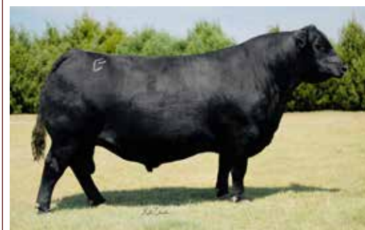
Baldridge Alternative E125