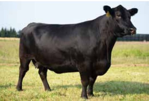
KB-Emma-Ten X-B02 Paternal granddam of lot 133.

An exciting calving ease Quantum son that has herd sire written all over him. Ranking near the top of the breed for a multitude of traits, including CED, BW, WW, YW, PAP, $W, $G. His dam has always been a standout as she had a successful show career as a heifer. Not only will he make awesome daughters but profitable feeder cattle.