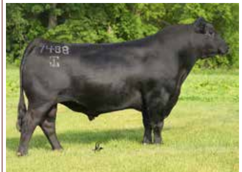
G A R Home Town